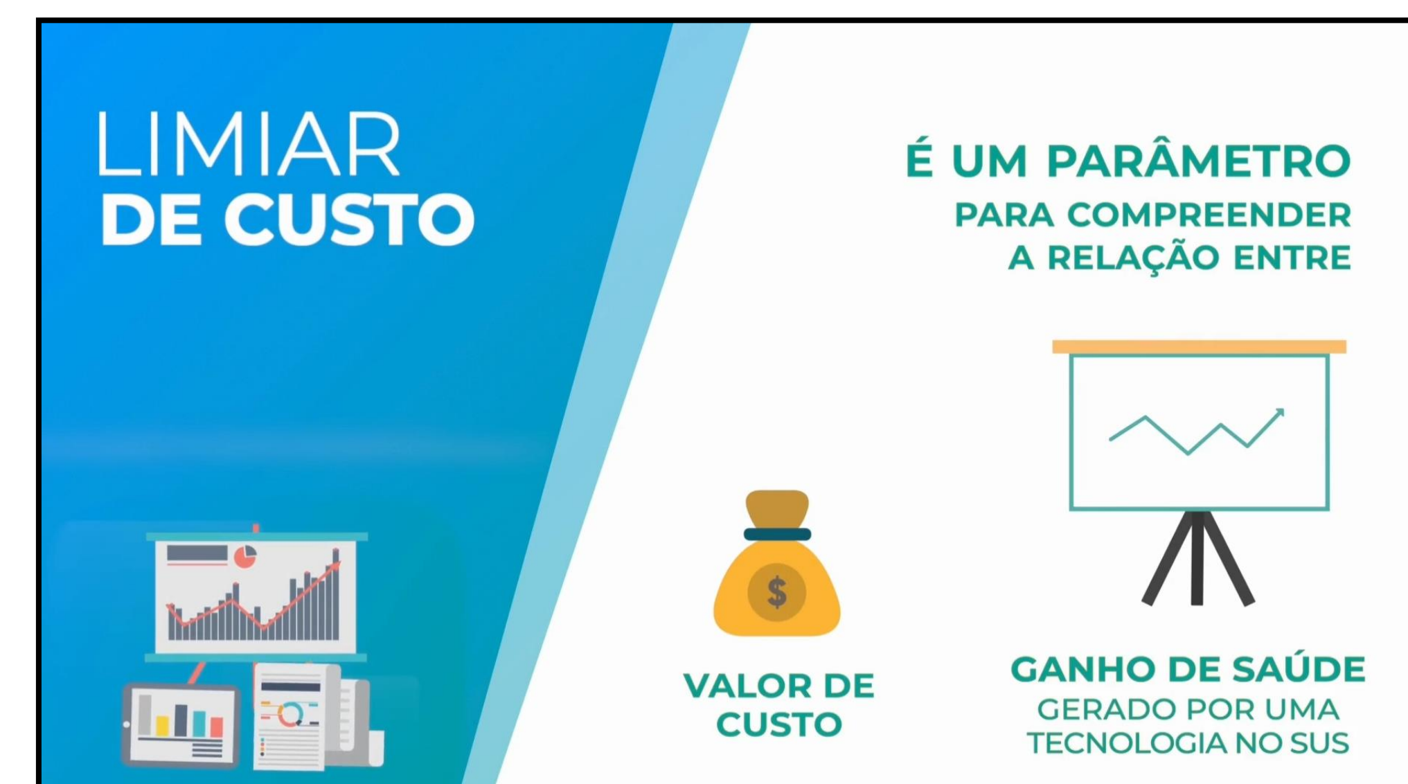
Cost threshold is a parameter for understanding the relationship between cost value and health gain generated by a technology in the Brazilian Healthcare System