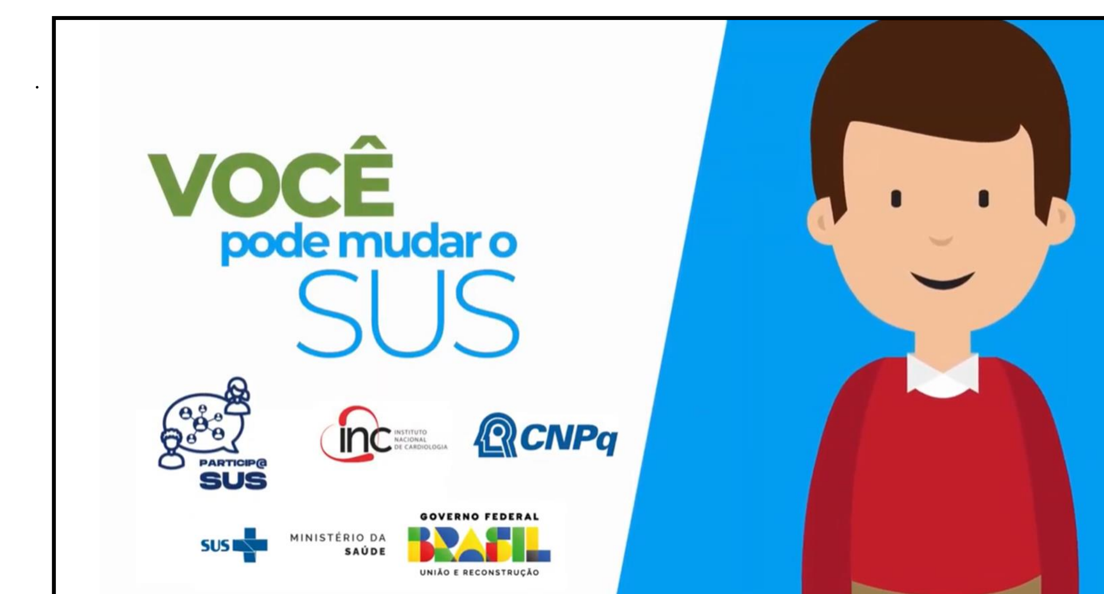
You can change the Unified Health System