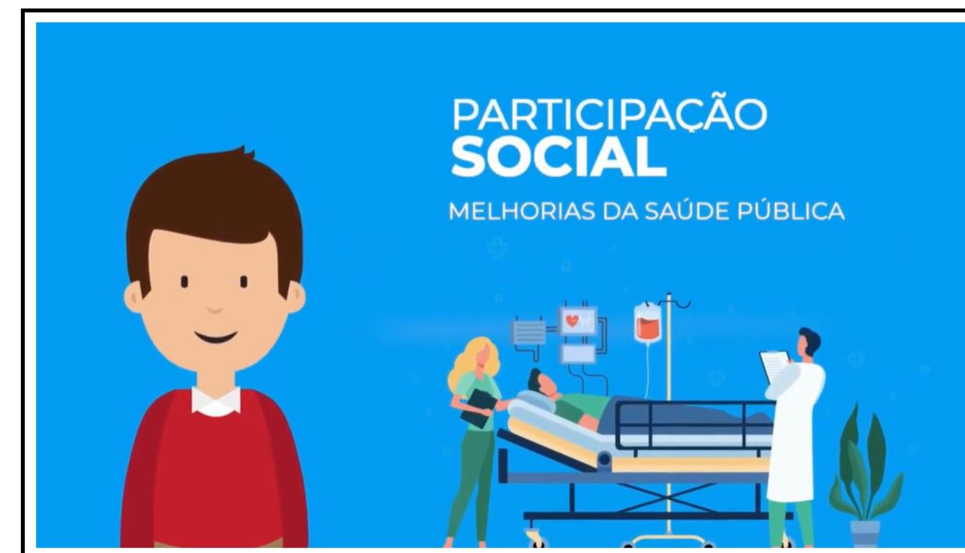
Social participation: public health improvements