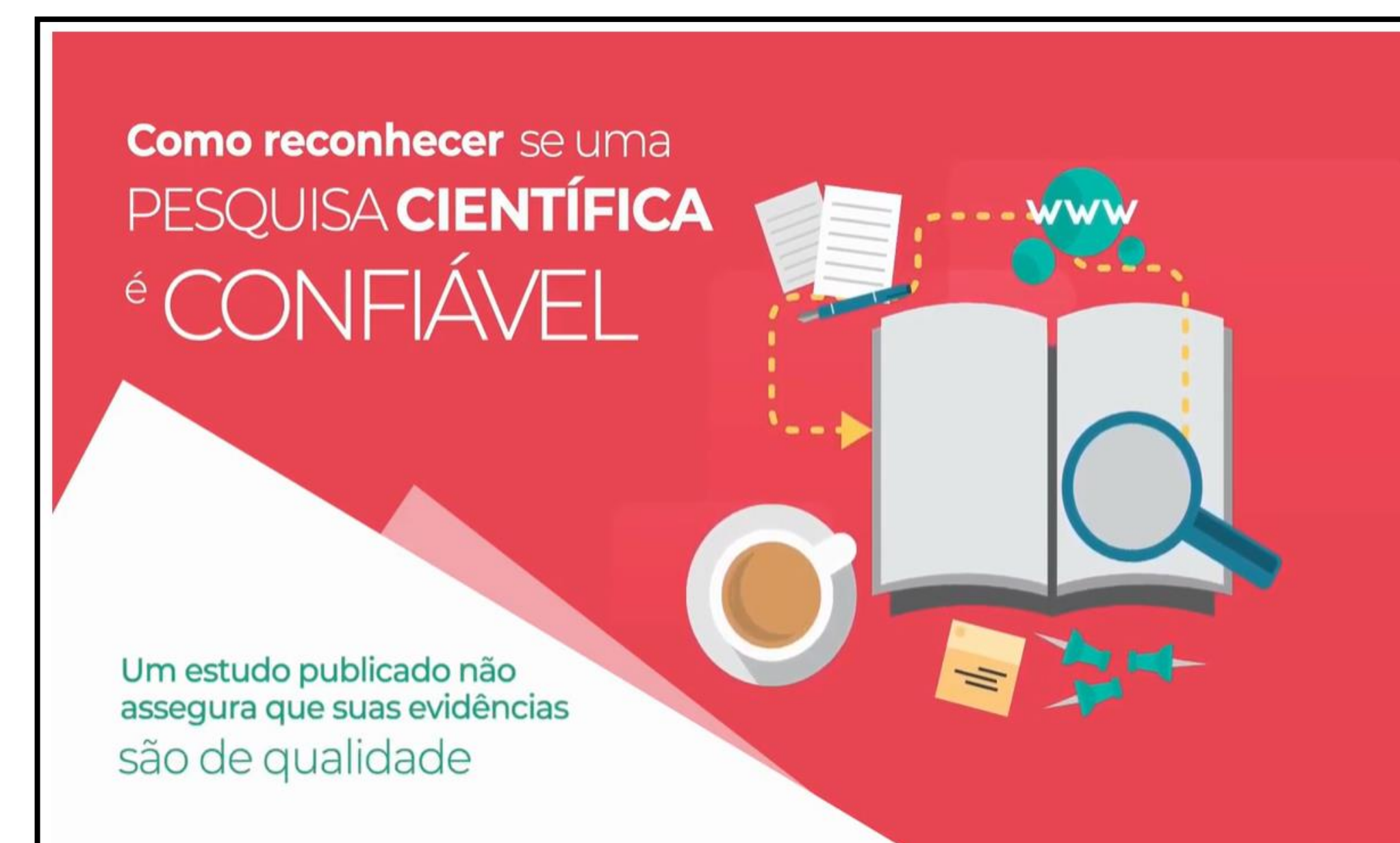
How to recognize if a scientific research is reliable?