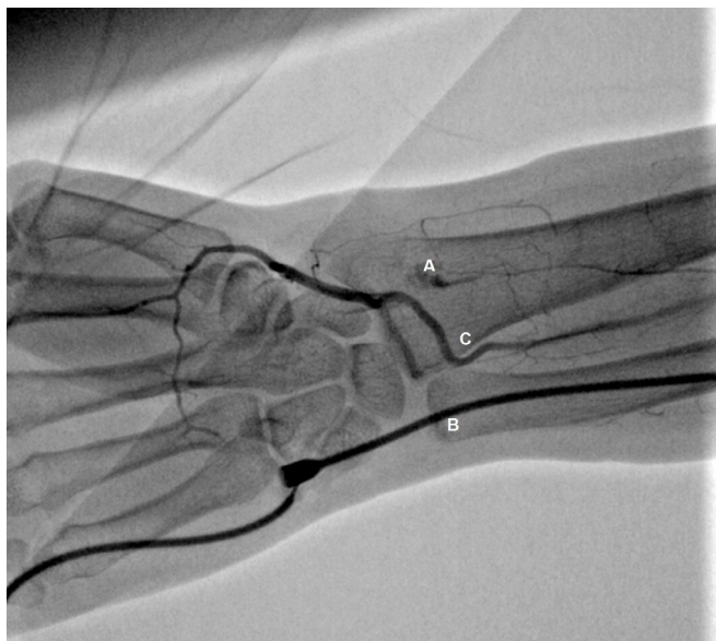
FIGURE 2. Forearm angiography. (A) Chronic radial artery occlusion. (B) Temporary occlusion of the ulnar artery by the sheath. (C) Blood flow from the palmar arch through the anterior interosseous artery.